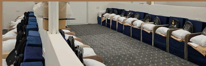
Give yourself a higher level of comfort and relaxation in our premium VIP tents 12 persons in a tent size 4x4 meters (2 tents may combine)