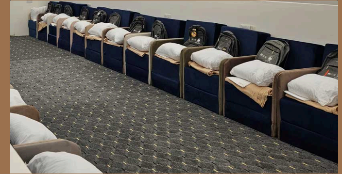
UPGRADE TO PREMIUM VIP MINA TENTS SAR 6000/-