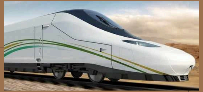
MADINA TO MAKKAH OR MAKKAH TO MEDINA haramain high speed Train optional

We understand how long you have awaited this sacred journey, and for that reason, we have designed a custom package with every detail carefully planned for the trip of a lifetime. A variety of add-ons and upgrades are available, with prices starting from just SAR 35,000 for the discerning traveler. Please note, Air ticket and Qurbani are not included.