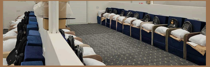
Give yourself a higher level of comfort and relaxation in our premium VIP tents 12 persons in a tent size 4x4 meters (2 tents may combine)