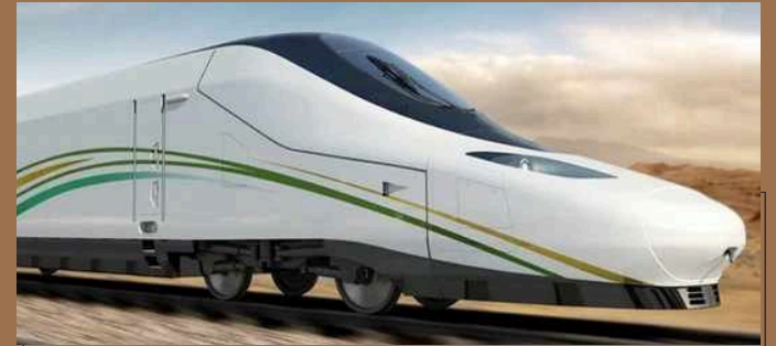
MADINA TO MAKKAH OR MAKKAH TO MEDINA haramain high speed Train optional

We understand how long you have awaited this sacred journey, and for that reason, we have designed a custom package with every detail carefully planned for the trip of a lifetime. A variety of add-ons and upgrades are available, with prices starting from just SAR 35,000 for the discerning traveler. Please note, Air ticket and Qurbani are not included.