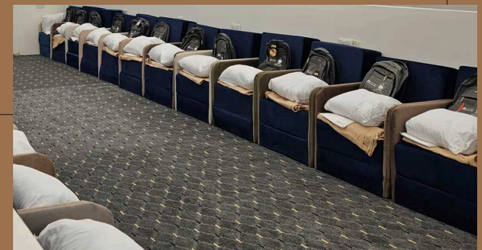
UPGRADE TO PREMIUM VIP MINA TENTS SAR 6000/-